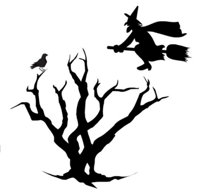
Image of witch thanks to http://www.clipartlord.com/category/halloween-clip-art/witch-clip-art/

Original text from Perpetual Preschool <a href="http://www.perpetualpreschool.com/halloweensongs.html">http://www.perpetualpreschool.com/halloweensongs.html</a>